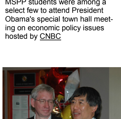
MSPP students were among a select few to attend President Obama's special town hall meeting on economic policy issues hosted by CNBC