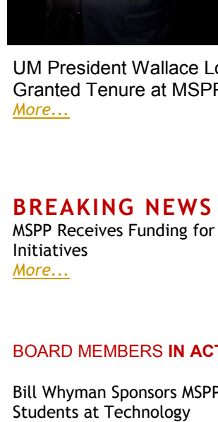
UM President Wallace Loh Granted Tenure at MSPP