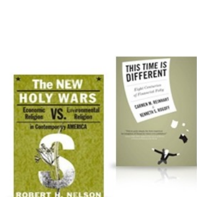
Nuke the oil well?