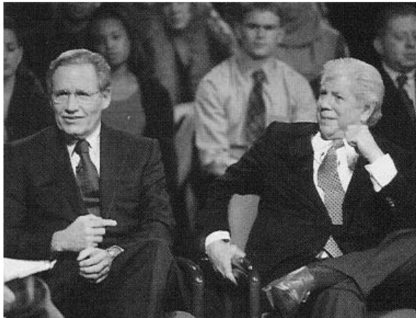
Legendary investigative journalists Bob Woodward (left) and Carl Bernstein reflect on the 30th anniversary of the Watergate break-in and the state of contemporary journalism.

"If he didn't tape it, we would have never known," says Bob Woodward , 30 years after he and Carl Bernstein broke the biggest political story in journalism history and set in motion the public demise of an American president. The Pulitzer Prize-winning Washington Post reporting duo, whose coverage of President Richard M. Nixon after the 1972 Watergate break-in revealed an administration mired in illegal activities, made a rare joint appearance at the Maryland School of Public Affairs